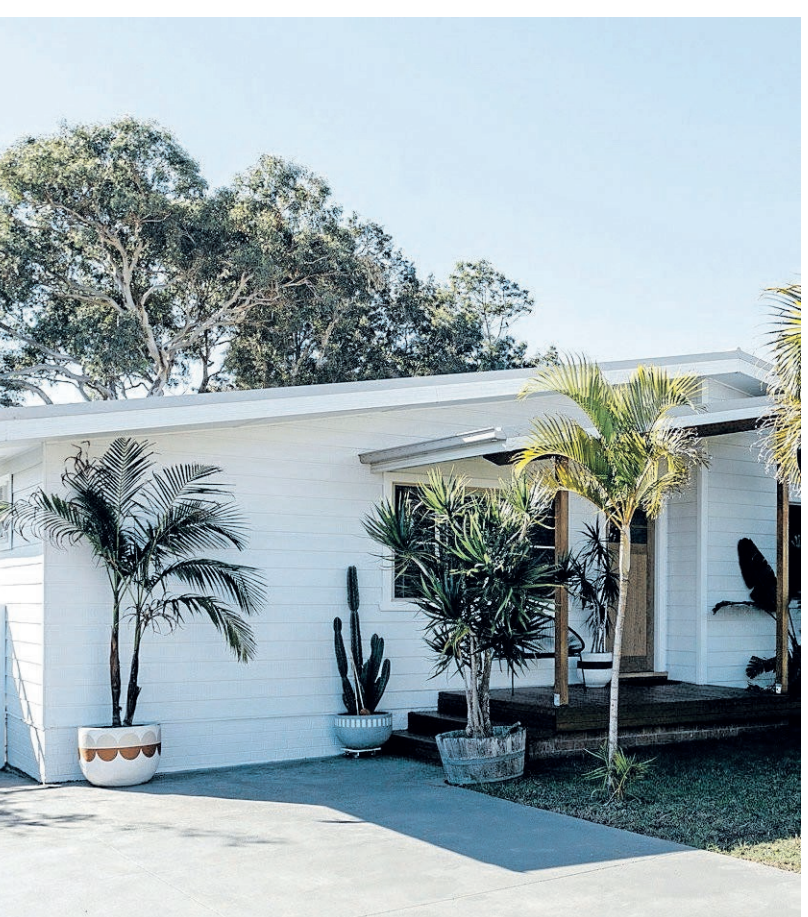
FRESH LOOK: Colorbond roofing and Weathertex cladding.

A case in point are the unique barn doors on steel rails which connect the central living area to the laundry, main bathroom