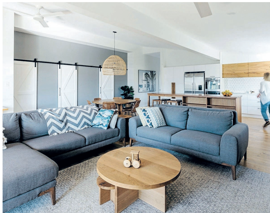
MODERN TOUCH: The cottage was opened up with new ideas.