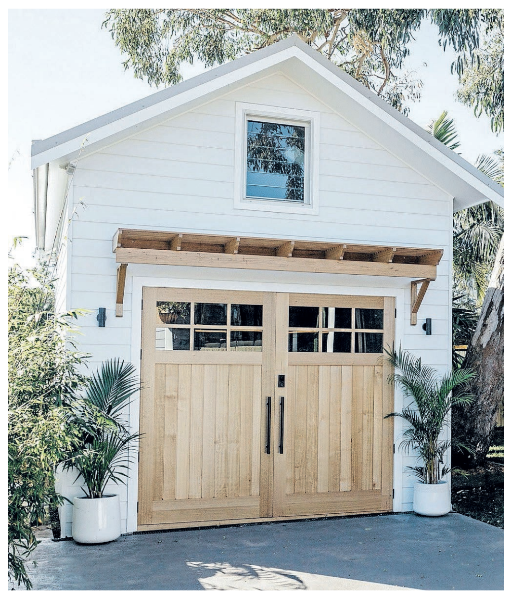
THE BARN: A special project in itself, a great family space.

The Loughlins decided to sell the property and move closer to the beach. It sold quickly, much more than a humble cottage.